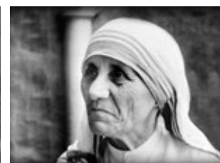
Mother Teresa of Calcutta