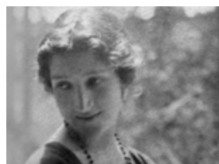
Antonieta Rivas Mercado