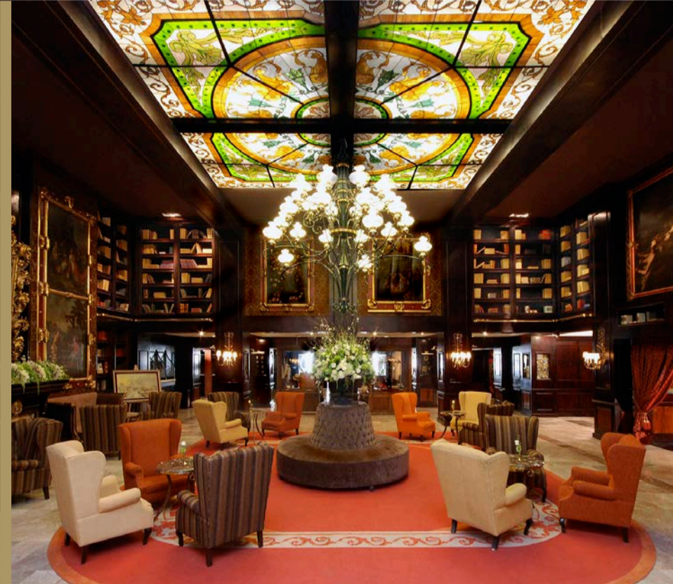
Mexico City 1907-2022 No.2