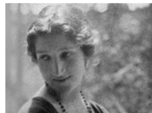
Antonieta Rivas Mercado