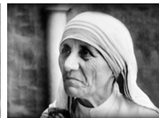
Mother Teresa of Calcutta