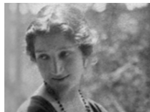
Antonieta Rivas Mercado