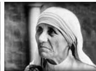
Mother Teresa of Calcutta